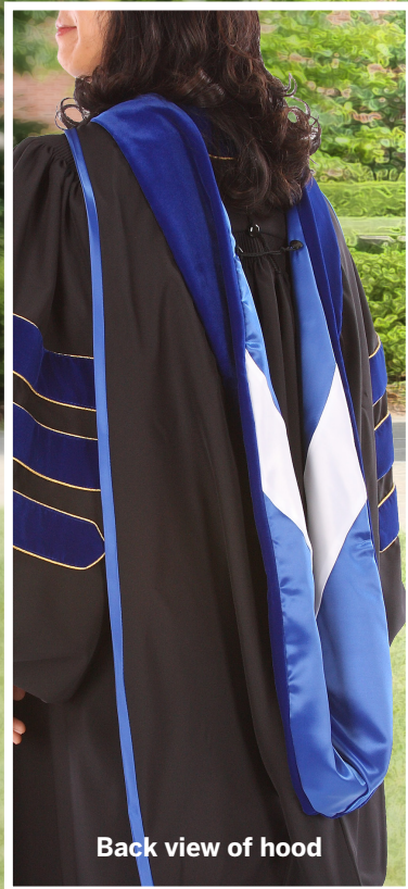
Back view of hood